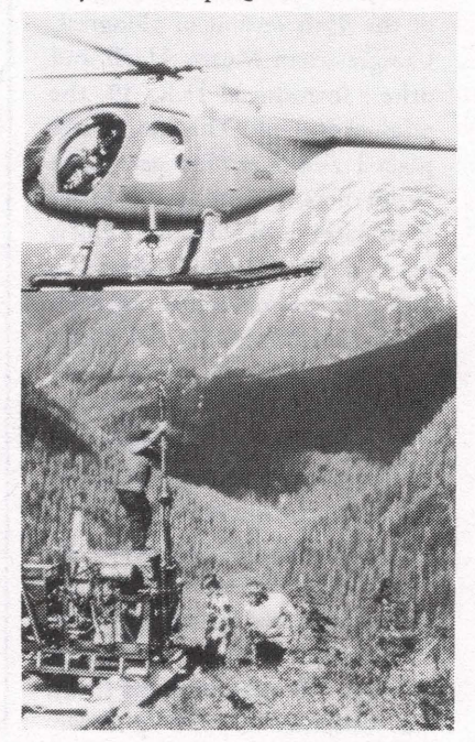
A helicopter slings an exploration drill into place at Quartz Hill in 1975

The company regarded these actions as a clear and significant threat to its ability to develop Quartz Hill and felt