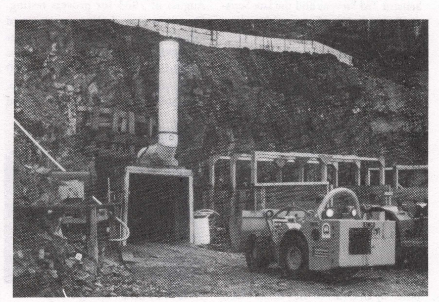
Collar of one of two bulk sampling adits, Quartz Hill molybdenum deposit (1981).

The company was pleased with the passage of ANILCA because it removed the severe (if not impossible) burdens imposed by the previously mentioned administrative land designations and withdrawals. Development of Quartz Hill was allowed under special restrictions spelled out in Sections 503, 504 and 505 of ANILCA, which set aside from the surrounding Wilderness an area of 152,610 acres of land needed for development and established conditions which would assure protection of the fisheries and the environment. These conditions were the result of negotiations between members of the staffs of the U.S. Senate and House of Representatives, the Administration,