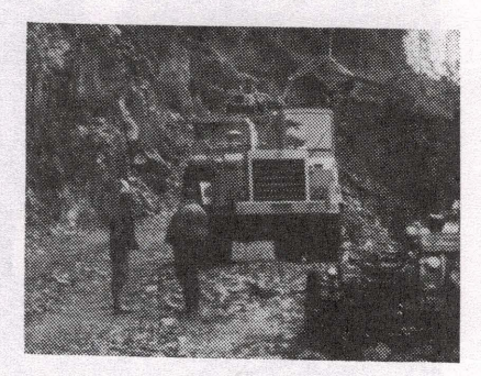
Road construction through tough terrain in May, 1983

A 4,800 ton bulk sample mined by underground means was barged out in August of 1983 for process testing. Development drilling continued through 1983, eventually totaling over 268,000 feet, which outlined a massive mineral deposit about 5,000 by 7,000 feet in plan and up to 1,700 feet deep. Mineable tonnage was now estimated